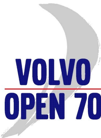
Diagram 1: Positive variant on a light background