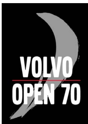
Diagram 2: Negative Variant on dark background